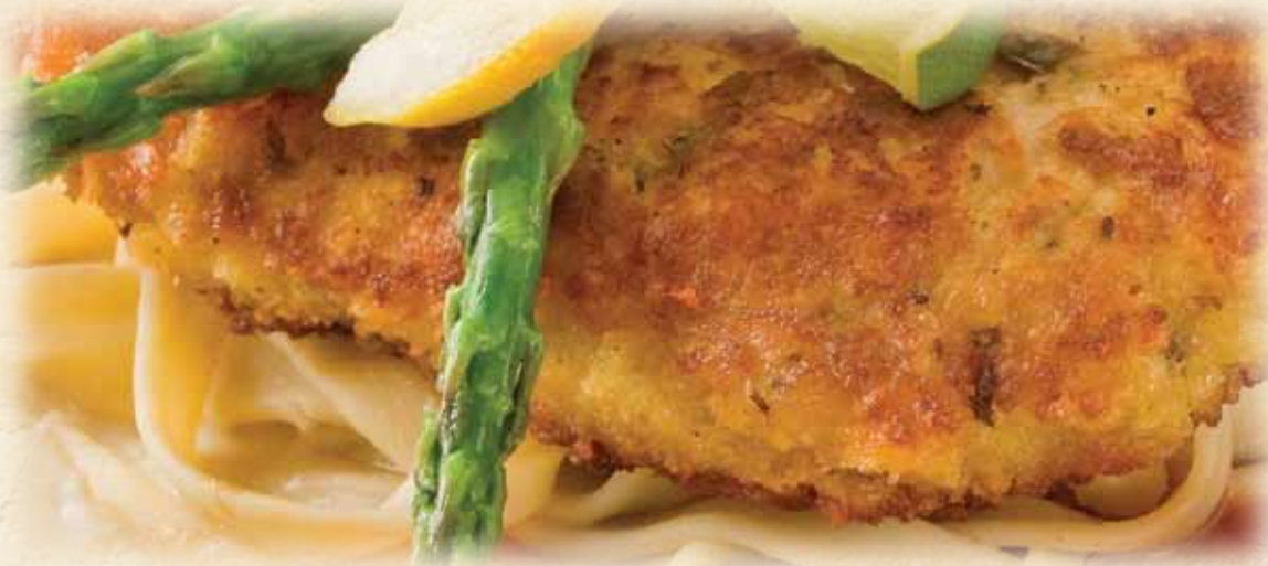
Romano Encrusted Chicken Pasta