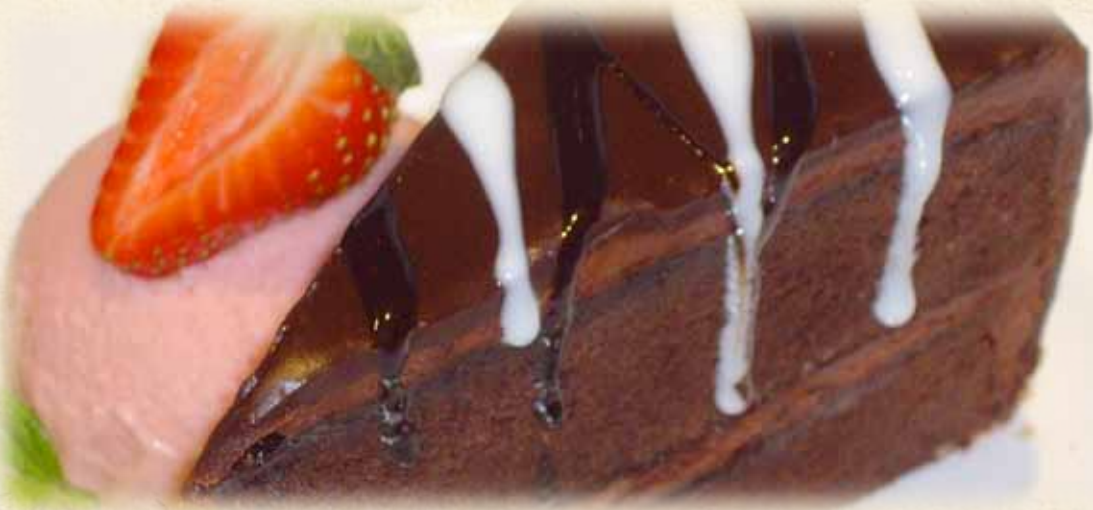
Classic Chocolate Cake