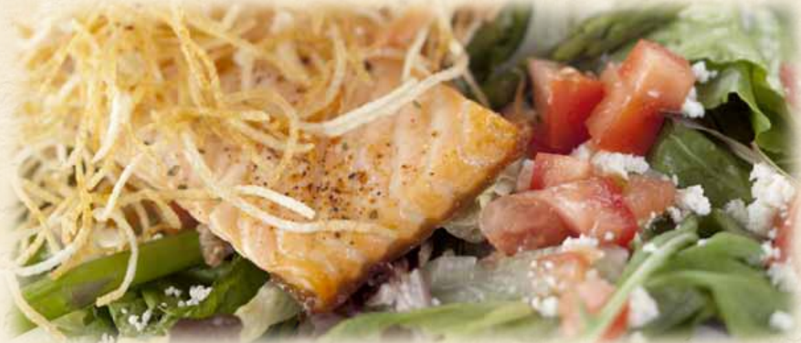
Roasted Salmon Salad