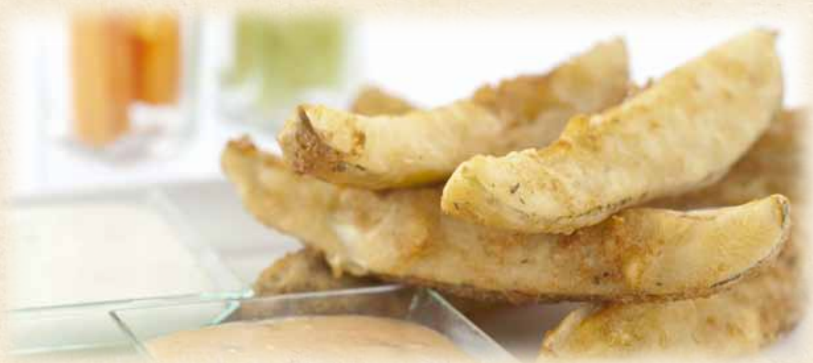
Fried Dill Pickles